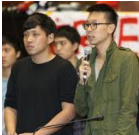
Civil Society Leaders