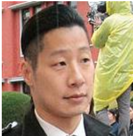
New Power Party